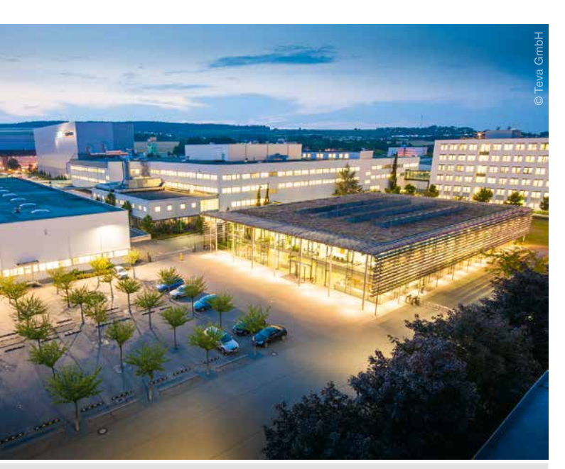
TEVA headquarters in Ulm, Germany

TEVA Pharmaceutical Industries Ltd. is among the top 20 drug manufacturers in the world. With its two manufacturing facilities in Ulm and Blaubeuren-Weiler, the German production site is the group's largest and most complex facility. For example, one of TEVA's brands is ratiopharm, which offers the highest-quality drugs at an affordable price.