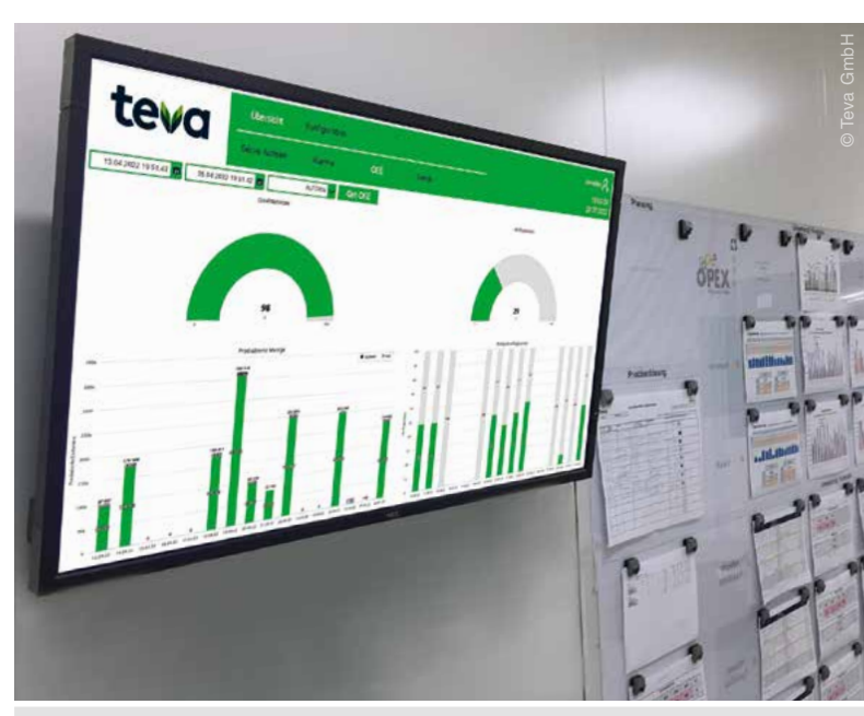
Production control is improved compared to earlier methods, thanks to the digital display of overall equipment effectiveness (©TEVA)

Data acquisition can be configured in such a way that overall equipment effectiveness (OEE) is not just measured and compared at defined intervals; it can also be improved by means of targeted measures. Quality standards, machine availability, and throughput are all optimized. The application can be flexibly modified to meet precise requirements. Historical data remains accessible even when there is a change of personnel or shift.